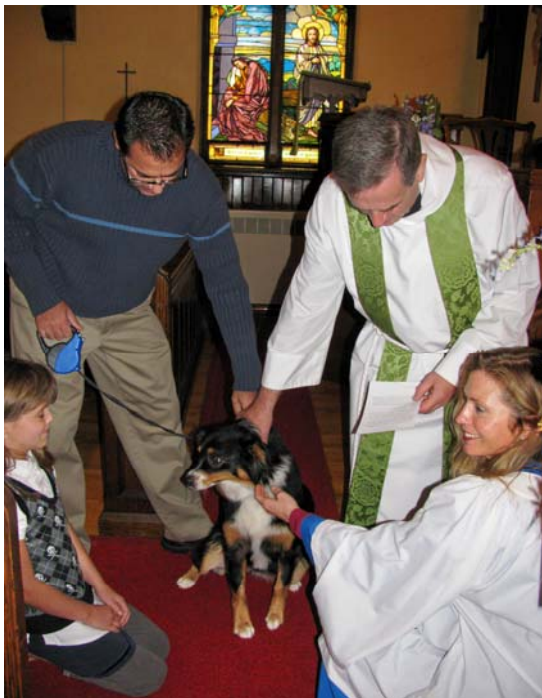
The Lanese family